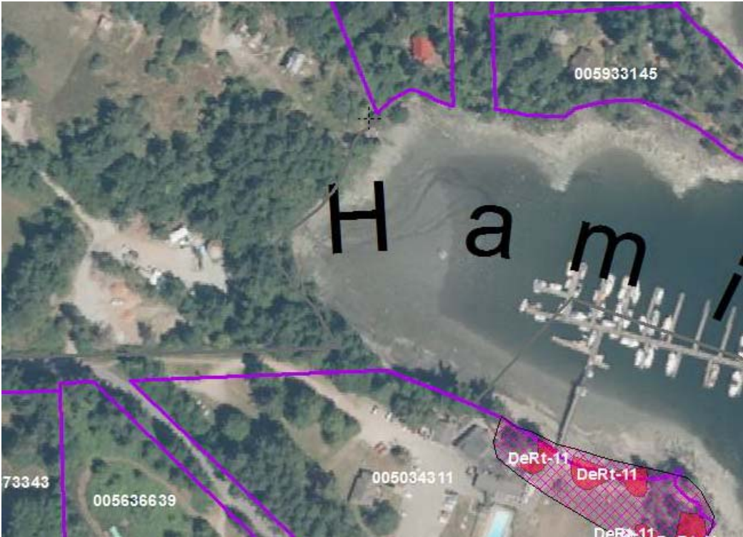
Medicine Bay location.