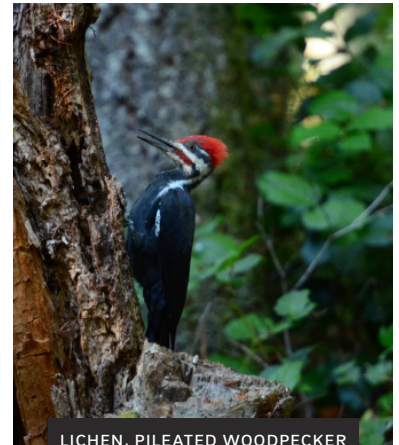
LICHEN, PILEATED WOODPECKER