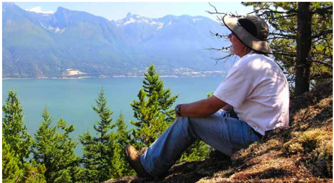
Mount Artaban Nature Reserve, Gambier Island

In December 2010, the Islands Trust Conservancy approved a five-year Regional Conservation Plan (2011-2015). In 2014, the Regional Conservation Plan was extended until the end of 2017. In January 2018, the Islands Trust Conservancy Board approved a new 10-Year Regional Conservation Plan.