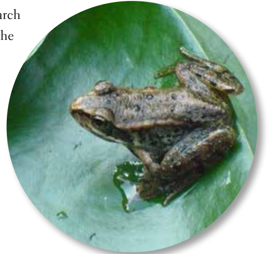
Frog Haven NAPTEP covenant, Salt Spring Island

The board will continue to promote legacy gifts as a way to fund the protection and stewardship of ecologically significant lands in the region.