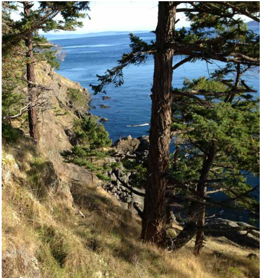
Wallace Point NAPTEP covenant, North Pender Island

The 2018-2027 Regional Conservation Plan is posted on the Islands Trust Conservancy website: www.islandstrustconservancy.bc.ca