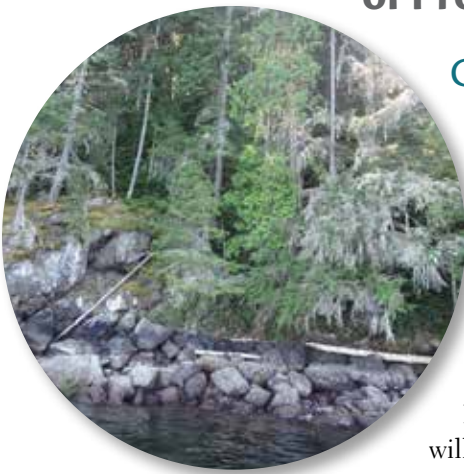
Moore Hill Nature Reserve, Thetis Island