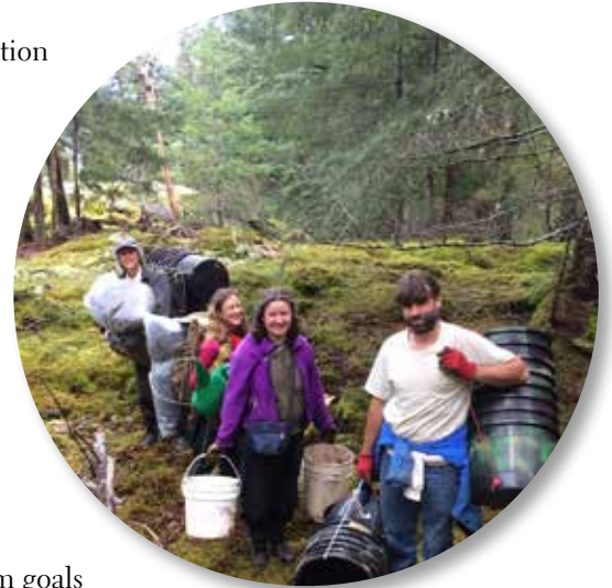
Volunteer clean up at Kwel Nature Reserve, Lasqueti island

Based on scientific information and local knowledge, the Regional Conservation Plan identifies areas of interest for conservation within the Islands Trust Area and strategies for achieving better levels of land conservation. Some of the strategies involve land acquisition and conservation covenants with willing landholders. Other strategies involve working with First Nations, partner agencies, local trust committees and Bowen Island Municipality to increase our knowledge base, encouraging protection of ecologically significant land within the Islands Trust Area and managing existing conservation lands effectively.