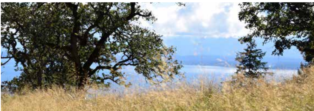
Fischer Covenant, Hornby Island