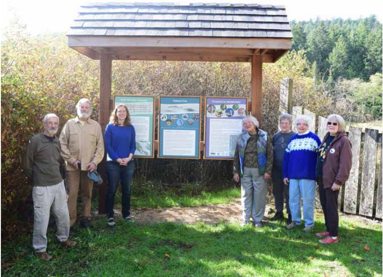
Medicine Beach Nature Sanctuary North Pender Island

The Islands Trust Conservancy looks forward to the next five years of conservation successes, inspired by the generosity and perseverance of our partners, collaborators and supporters, and the endless beauty of fragile island ecosystems.