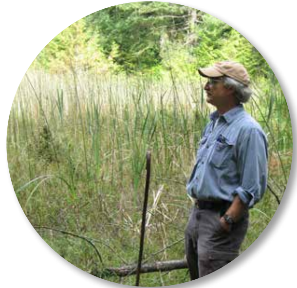
Fairy Fen Nature Reserve, Bowen Island

The board and staff will solicit funds for the purposes outlined in existing Fund Guidelines 4 and Fund Agreements 5 . The Islands Trust Conservancy will not solicit funds for purposes outside of those approved in Fund Guidelines or Fund Agreements unless it has first reviewed and approved the additional fundraising activity. The Islands Trust Conservancy currently manages nine funds.