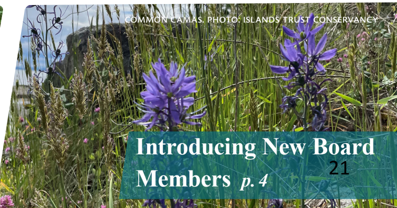
COMMON CAMAS.