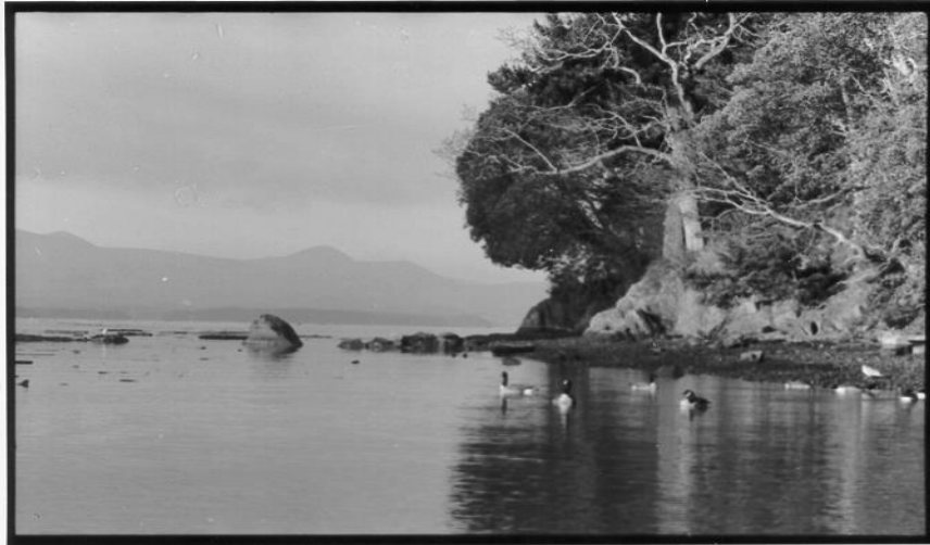
BOOTH BAY