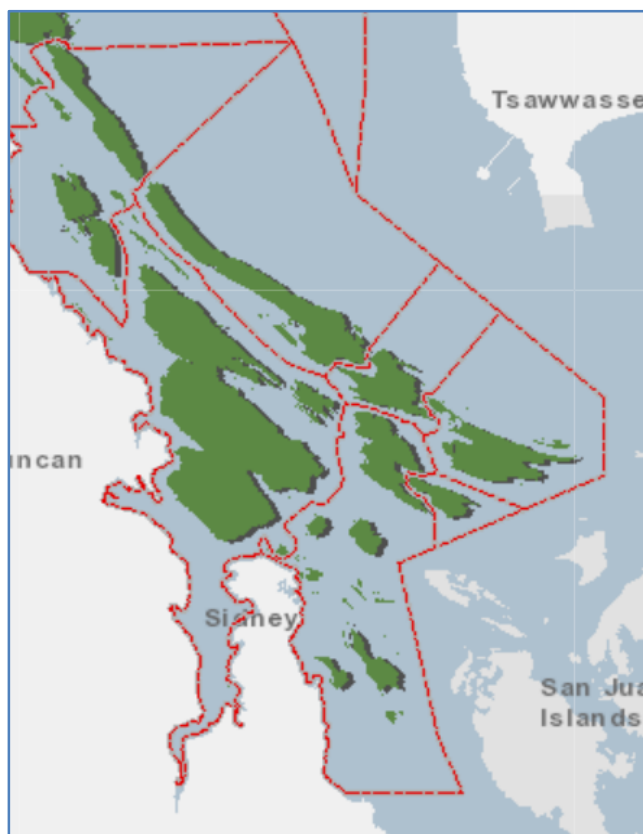
Figure 1 Local Trust Area Boundaries

A local community commission, with an elected membership, is a form of delegated commission within a regional district electoral area, under the Local Government Act . In December, 2022 the Capital Regional District (CRD) Board adopted a bylaw to establish a Salt Spring Island (SSI) LCC, following voter endorsement by referendum (Attachment 2). The SSI LCC will be comprised of five members, one of whom will be the Electoral Area Director for Salt Spring Island. A public election will be held for four commissioners in accordance with the LGA on May 27. The scope of authority of the SSI LCC covers the extent of the Salt Spring Island Electoral Area of the Capital Regional District. The area is mostly contained within the Salt Spring Island Local Trust Area (SS LTA) 1 , but does not contain all of it. Figures 1 and 2 below show the boundaries of each. The SSI LCC Area does not include other islands within the SS LTA such as Piers Island, Prevost Island, Wallace Island, the Secretary Islands, and Mowgli Island as well as the marine area extending into the Saanich inlet and along Vancouver Island.