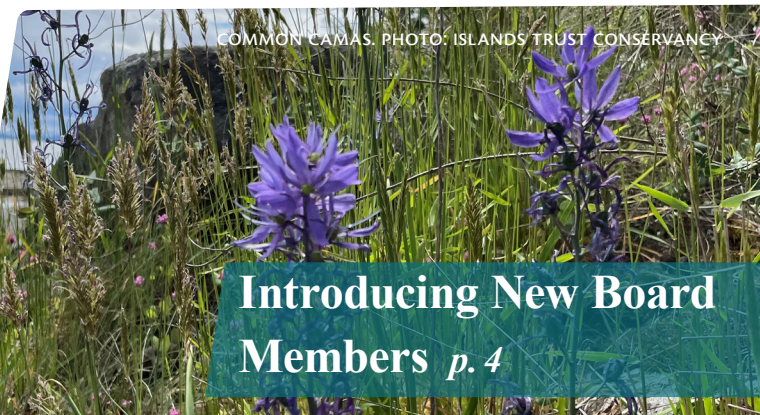
COMMON CAMAS.