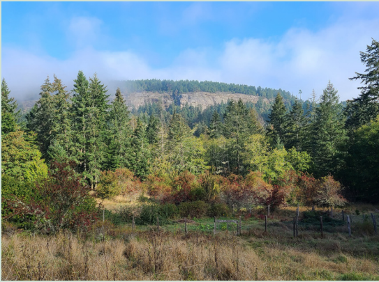
LONGINI COVENANT.