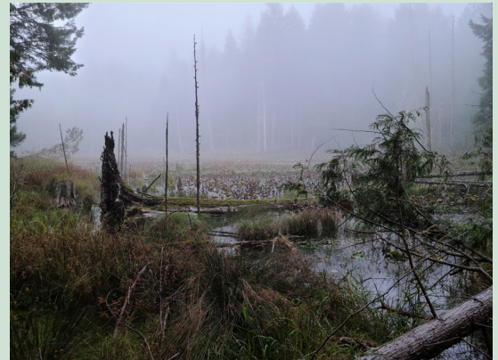
POND AT GREEN FROG FARM COVENANT.