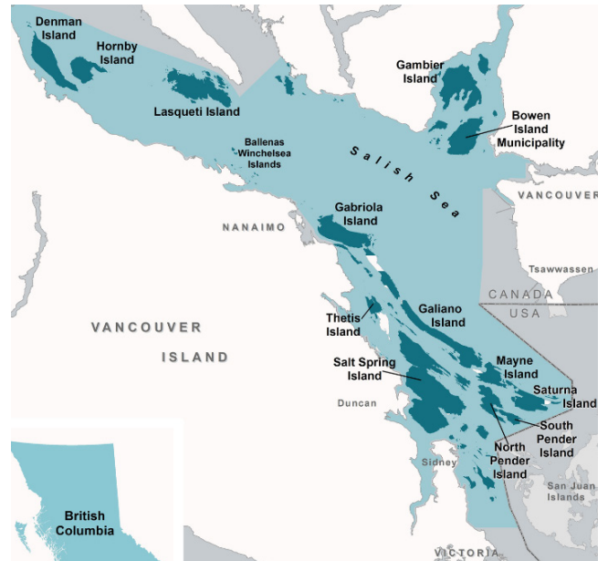
MAP OF THE ISLANDS TRUST AREA.

ITC is celebrating its 35th anniversary through various initiatives, including the launch of a new blog on the ITC website, titled the Islands Trust Conservancy Journal . Contribute your stories, memories, and positive words about ITC for the Journal through the survey: https://www.surveymonkey.com/r/ITC35th .