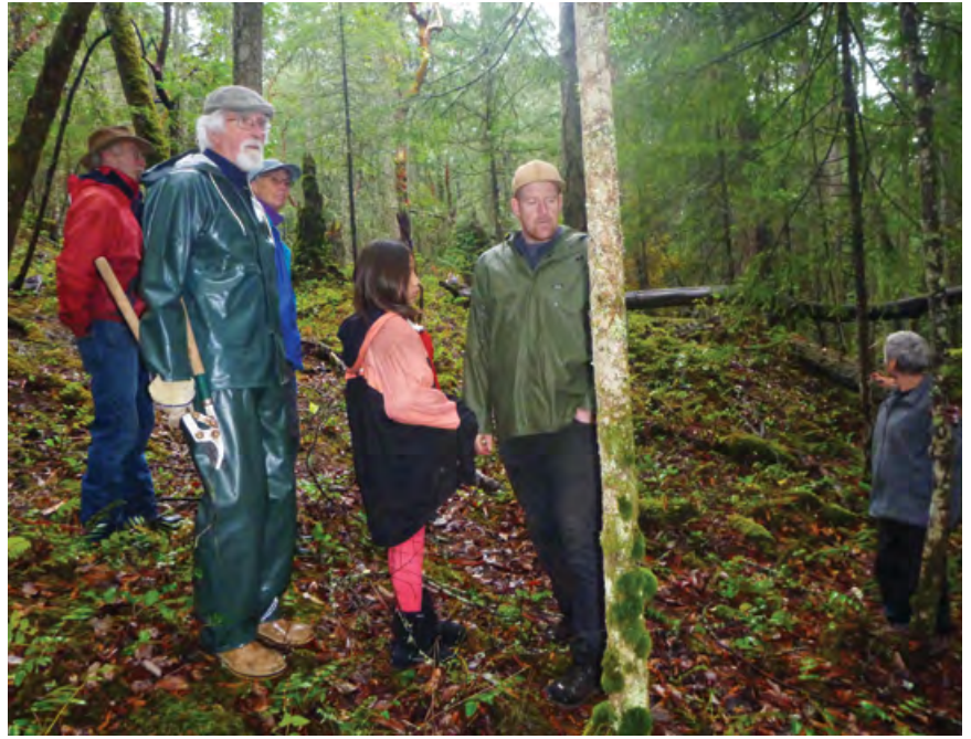
Trail Building in Fairyslipper Forest Nature Reserve, Thetis Island

As magical as all of this is, the magic started much earlier — seven years ago when ThINC, with Islands Trust Conservancy, the Cowichan Community Land Trust, Sitka Foundation, the Gosling Foundation, the BC Ministry of Transportation and Infrastructure, and individuals like you, shared a vision to