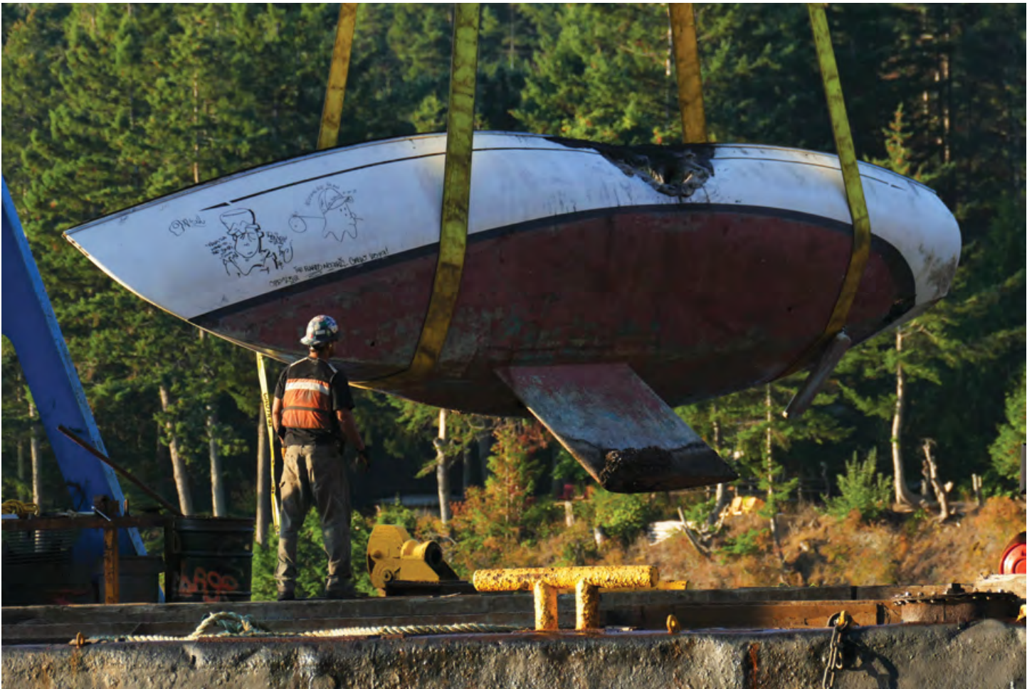
Dead Boat Society swings into action as it lifts a beached boat off Medicine Beach Nature Sanctuary.