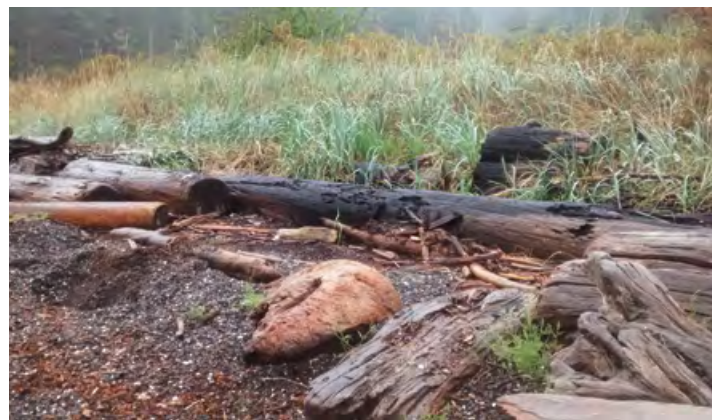
Done! Medicine Beach Nature Sanctuary is all cleaned up.

Medicine Beach has long been enjoyed by the Pender community as a place to walk, swim, or lounge by the oceanside. Please help