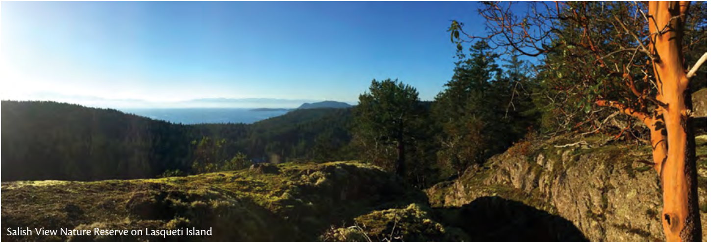
Salish View Nature Reserve on Lasqueti Island