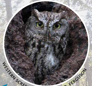
WESTERN SCREECH-OWL.

Protected areas shelter species-at-risk habitat from development and other negative human impacts. Our Species at Risk Program works with biologists to learn more about the species at risk on ITC protected lands. One example is our work with the Western Screech-Owl ( Megascops kennicottii kennicottii ) listed as Threatened under the Species at Risk Act, and provincially Blue-listed as a species of Special Concern. Due to historic logging, nesting cavities in big trees are limited. ITC staff, biologists, and volunteers have installed nest boxes across three ITC properties to enhance their habitat. Recently, their efforts were rewarded when Western Screech-Owl calls were picked up by audio recorders confirming their presence on the properties.