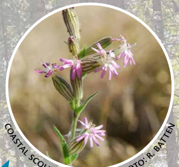
COASTAL SCOULER’S CATCHFLY.

High up in the Mt. Tuam Protected Area Conservation Covenant on Salt Spring Island grow the Coastal Scouler’s Catchfly and Yellow Montane Violet, both extremely rare and Endangered wildflowers found within Garry Oak meadows. To support their recovery, ITC installed fencing to protect their critical habitat from deer and other herbivores. In 2022, the catchfly population increased by 42% on Mt. Tuam thanks to work with biologists to augment their naturally-occurring populations with plantings grown from seeds collected on site. Protection of Yellow Montane Violet also helps to ensure the survival of the Endangered Zerene Fritillary ( Speyeria zerene bremnerii ) butterfly, who rely on violets to lay their eggs and feed their larvae.