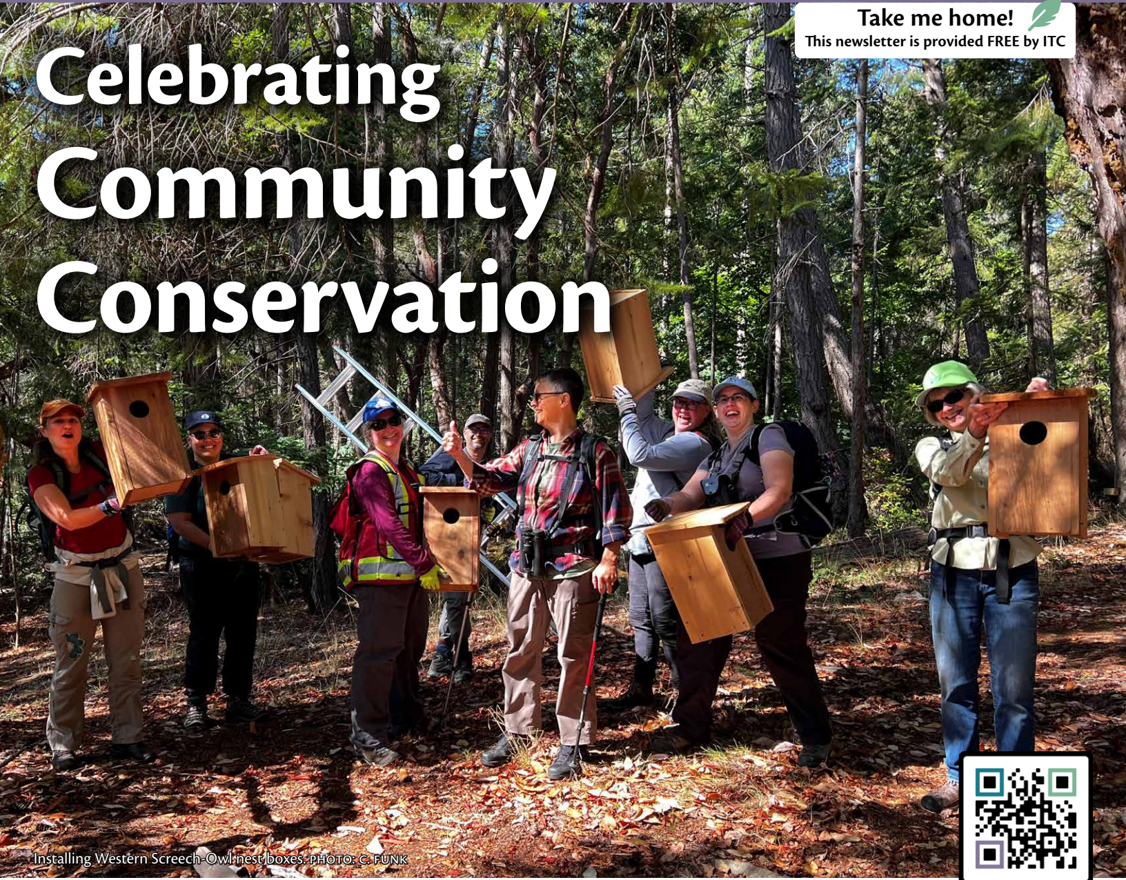
Installing Western Screech-Owl nest boxes.