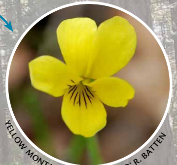
YELLOW MONTANE VIOLET.

Learn more about the species and places we protect at