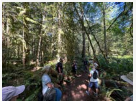
Community learning in an ITC Nature Reserve.

The purpose of Islands Trust Conservancy's Nature Reserves is to preserve and protect natural ecosystems and species forever. In her role, Nuala undertakes activities in the Nature Reserves including monitoring, surveys, research, and trail maintenance to preserve the biological integrity of the protected areas.