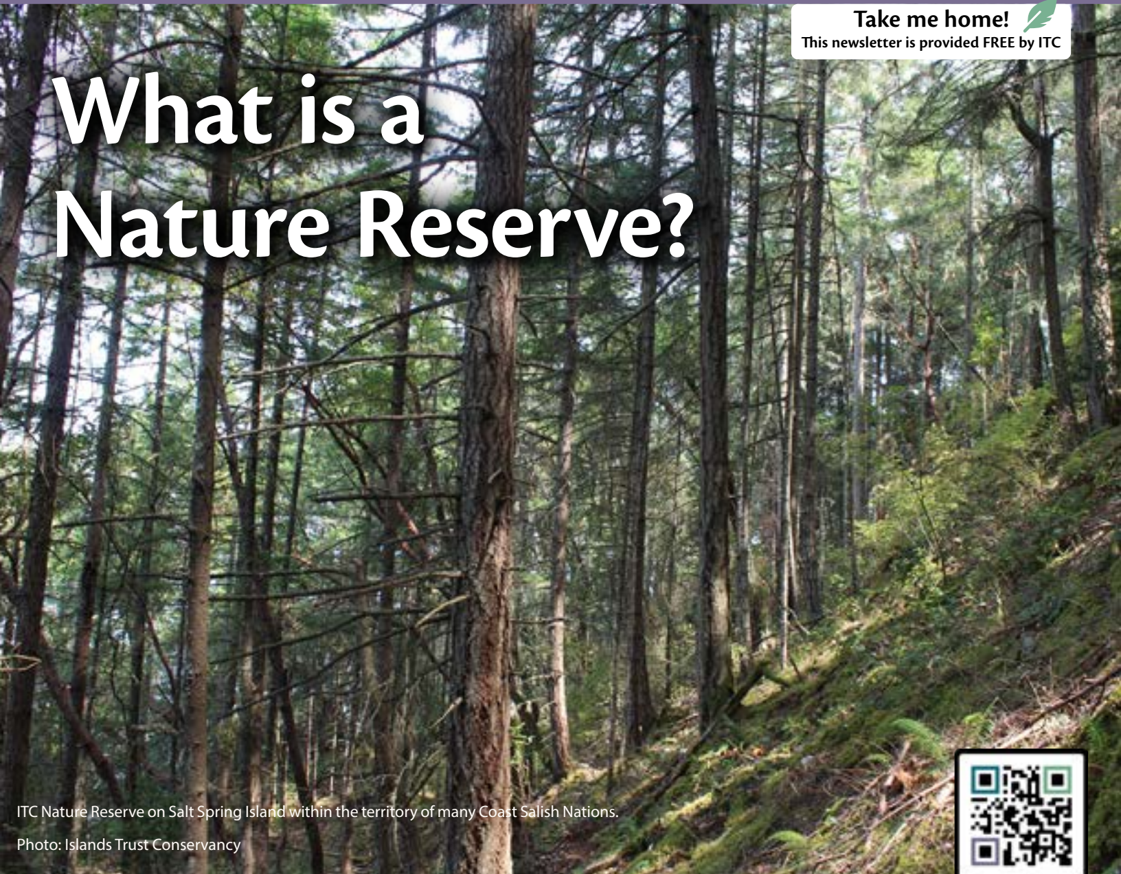
ITC Nature Reserve on Salt Spring Island within the territory of many Coast Salish Nations.